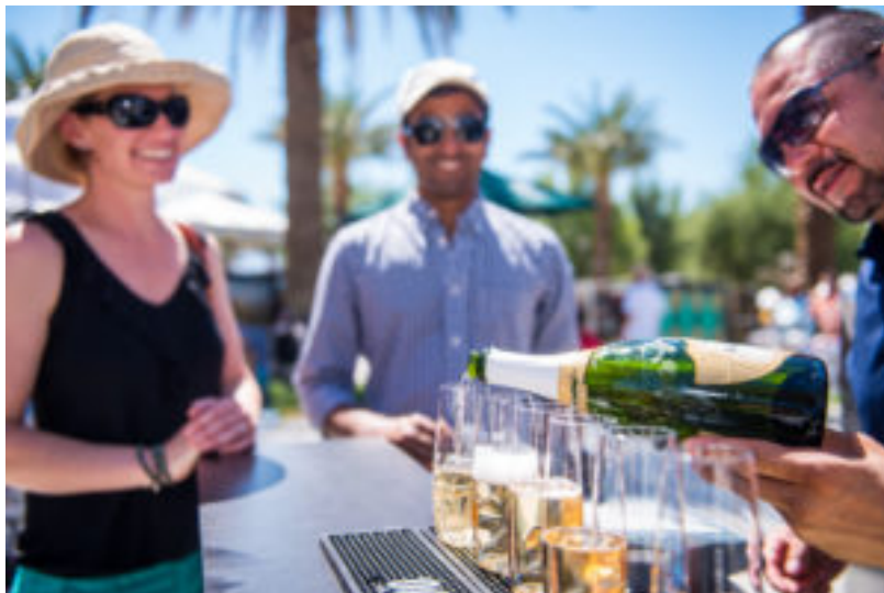
Indian Wells Arts Festival Champagne Circle. Saturday & EASTER Sunday "Eggs + Champagne in the Garden" Brunch Menu 'Till Noon

Spend Easter weekend perusing thousands of one-of-kind works of art from 200 of the top artists from around the world and across the nation at the 16 annual Indian Wells Arts Festival. Fun for the whole family awaits with plenty of free activities, artist demonstrations, live music and entertainment, a special Saturday and Easter Sunday "Eggs + Champagne in the Garden" brunch menu 'till noon, savory spirits and mimosas at the Champagne Circle Bar, and a Gourmet MarketPlace filled with original artisan fare.